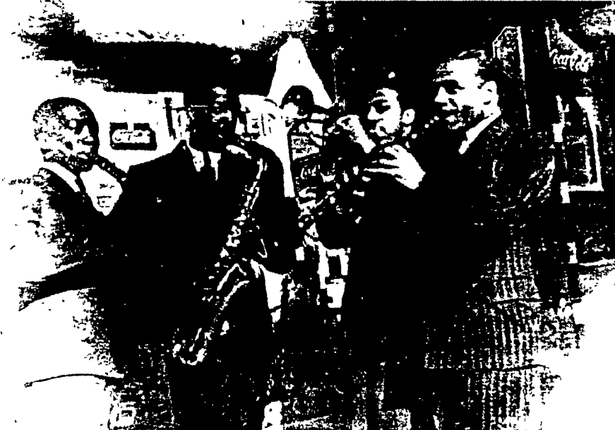
Mac Barnett 3rd from left