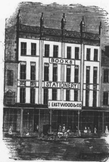
JOHN EASTWOOD &amp; CO'S. BOOK AND STATIONERY STORE