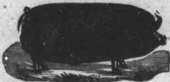
O'Mara's Mild Cure Bacon.