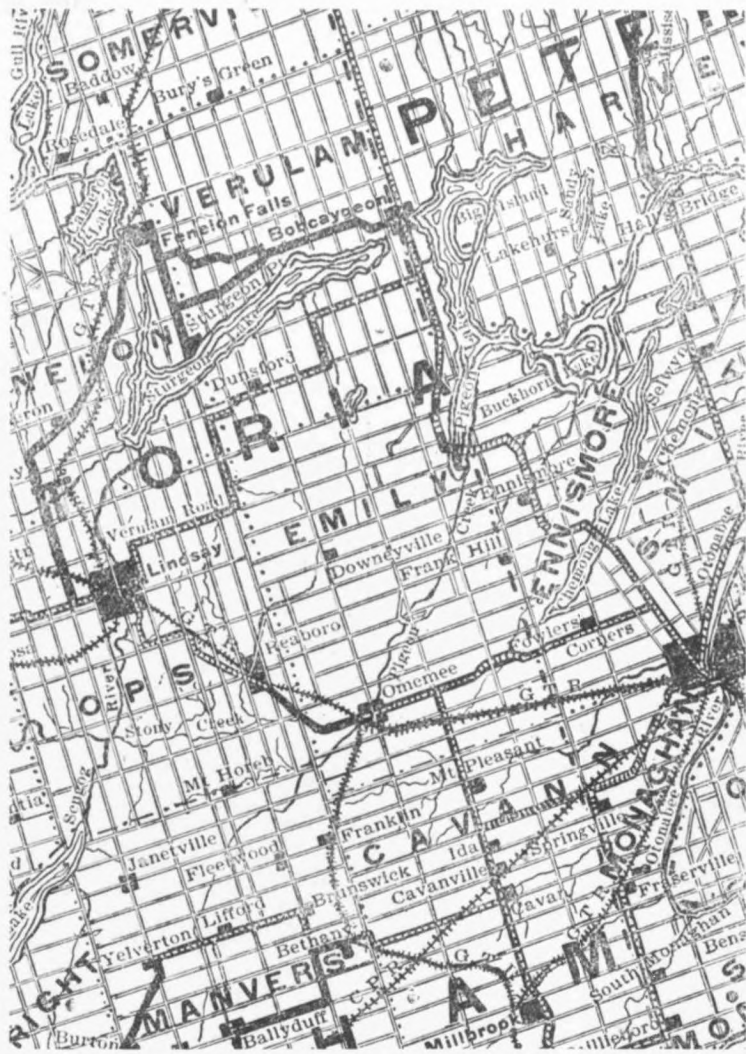
PART of FOSTER'S CYCLISTS' ROAD MAP of EASTERN ONTARIO.