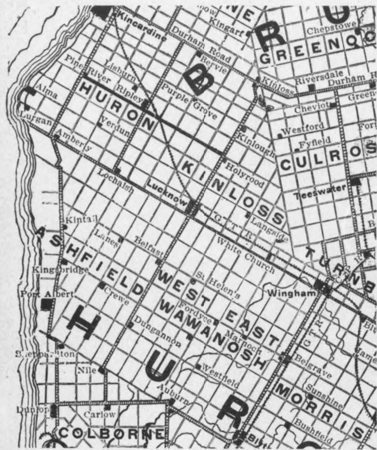
PART of FOSTER'S CYCLISTS' ROAD MAP of WESTERN ONTARIO.